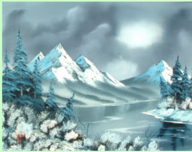
Cold Winters Morn

Forthcoming workshops include the following paintings so pick your favourite & 'lets have some fun.'