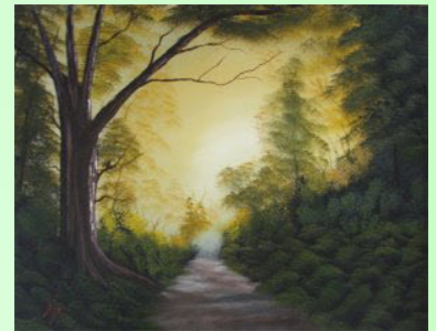
A Walk in the Woods