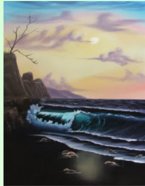
Dawn at the Coast